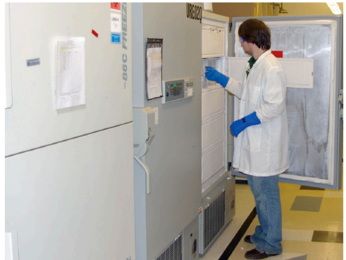
REPROCELL's CLIA Certified Lab