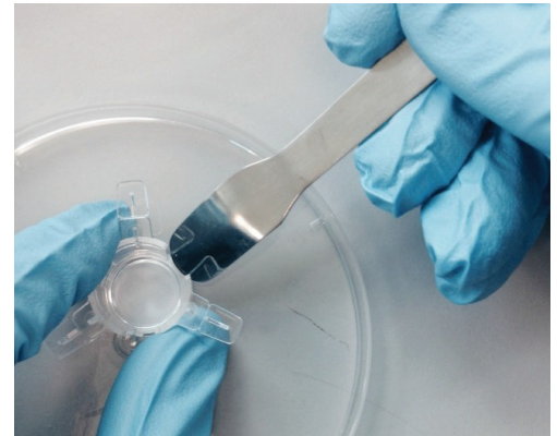
FIGURE 3. Pressing the spatula tip behind the well insert base hook.

Note: in the Figure 3 photo, the plastic sides of the well insert window can be seen reflected in the shiny metal spatula underside.