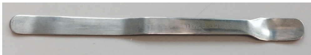
FIGURE 1. A Nuffield type spatula