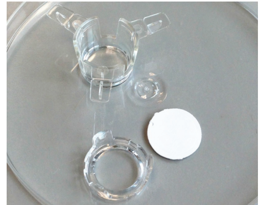
FIGURE 6. Alvetex membrane removed.