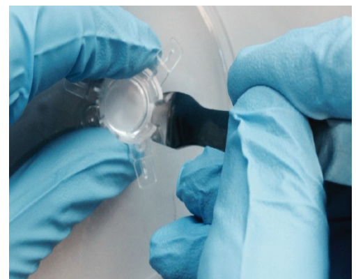
FIGURE 5. Un-hooking the well insert base.